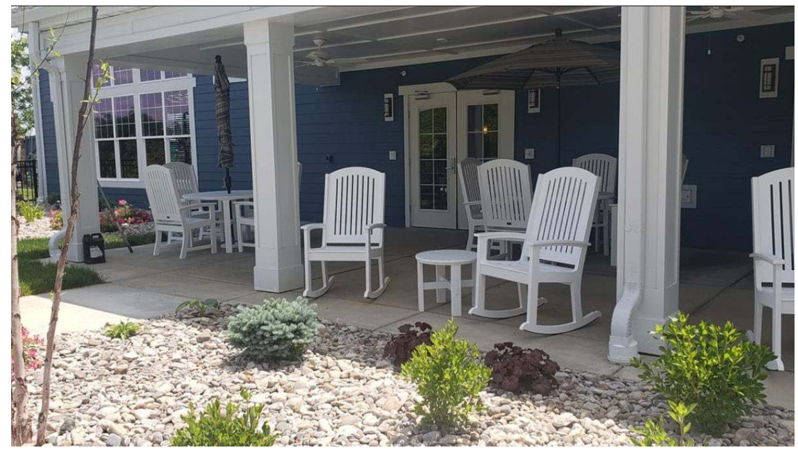
Plenty of Outdoor Porch Space to Enjoy for Visits or Relaxing.